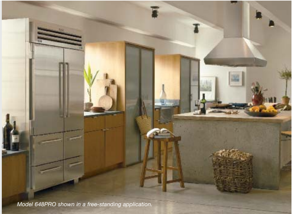
Model 648PRO shown in a free-standing application.

Born of 100% steel (and a good bit of bravado), model 648PRO is a true masterpiece of preservation. Its sculpted metal, dual refrigeration with three evaporators and advanced controls marry performance and design in a bold new way for home refrigeration. So it not only keeps foods magnificently fresh, it brings the whole kitchen tastefully up to date. Model 648PRO can be built-in or used in a free-standing application.