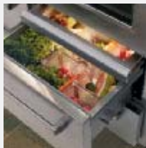
Glass crisper lid.